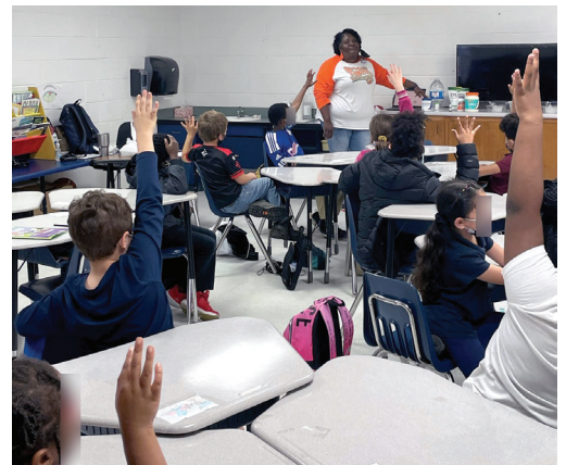
After school oral health classes result in healthier smiles for K-5 students.

We love oral health education that tastes amazing. And we’re eager to evaluate other yummy oral health projects to brighten the smiles of Arkansans.