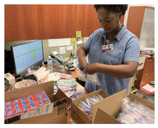
Marion High School staff member prepares oral health kits for at-risk and homeless students served by the school's Patriots Promote Smiles project