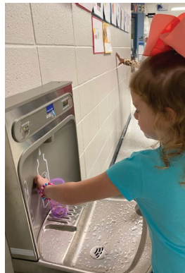
Monticello student filling her water bottle at the new hydration station