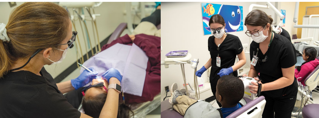
Dental Clinic at Wakefield Elementary