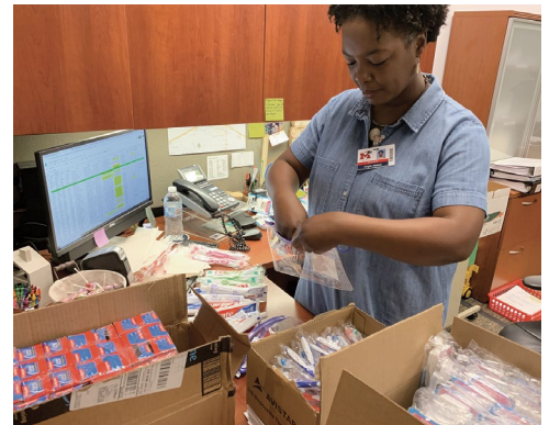
Marion High School staff member prepares oral health kits for at-risk and homeless students served by the school's Patriots Promote Smiles project